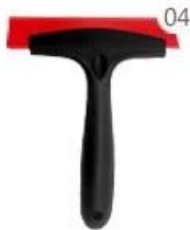
04 Rainbow Scraper