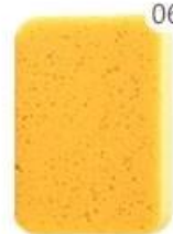
06 The sponge