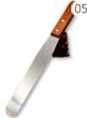
05 Stirring Knife