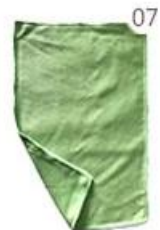
07 Scouring Pad