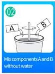
02 Mix components A and B without water