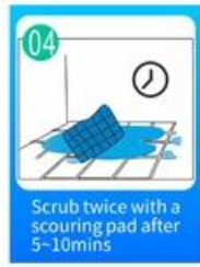
04 Scrub twice with a scouring pad after 5-10mins