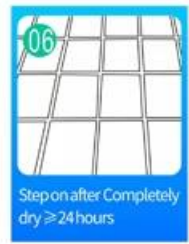
06 Step on after Completely dry ≥24hours