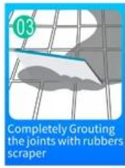
03 Completely Grouting the joints with rubber scraper