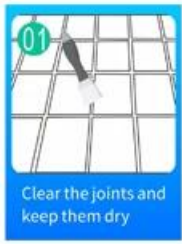
01 Clear the joints and keep them dry