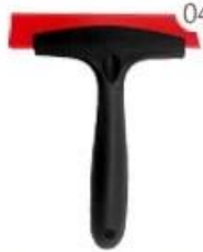
04 Rainbow Scraper