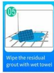
05 Wipe the residual grout with wet towel