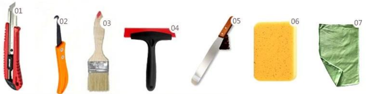
Cutter Knife Pointing trowel Brush Rainbow Scraper Stirring Knife The sponge Scouring Pad