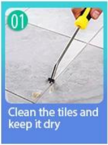
01 Clean the tiles and keep it dry