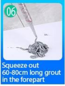
06 Squeeze out 60-80cm long grout in the forepart