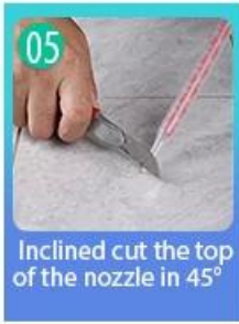
05 Inclined cut the top of the nozzle in 45°