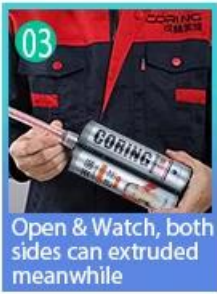
03 Open & Watch, both sides can extruded meanwhile