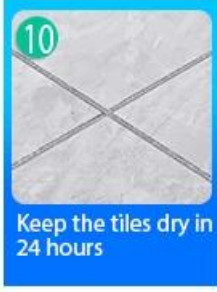
10 Keep the tiles dry in 24 hours