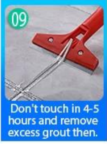
09 Don't touch in 4-5 hours and remove excess grout then.