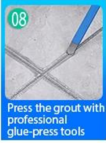
08 Press the grout with professional glue-press tools