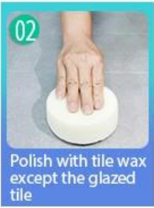
02 Polish with tile wax except the glazed tile