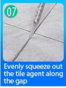
07 Evenly squeeze out the tile agent along the gap