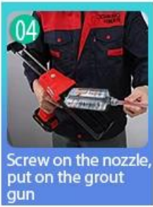
04 Screw on the nozzle, put on the grout gun