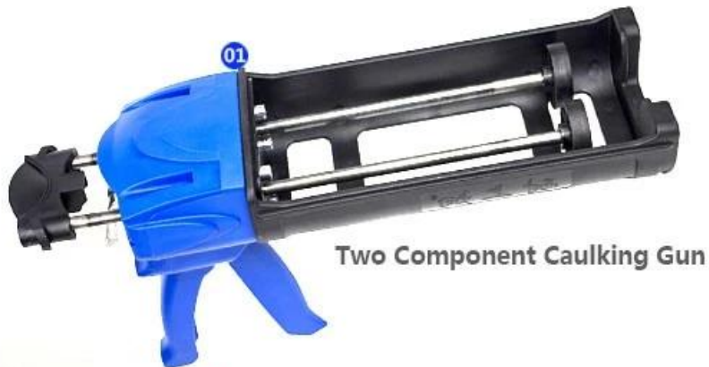
Two Component Caulking Gun