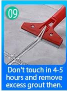
Don't touch in 4-5 hours and remove excess grout then.