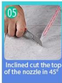
Inclined cut the top of the nozzle in 45°