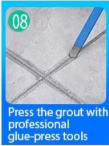
Press the grout with professional glue-press tools