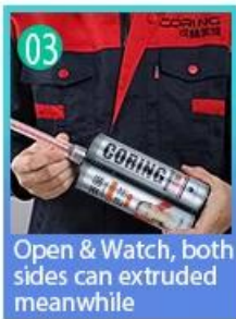
Open & Watch, both sides can extruded meanwhile