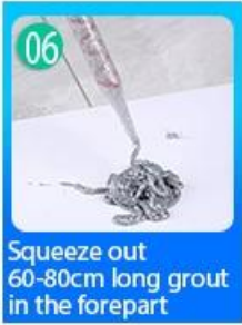
Squeeze out 60-80cm long grout in the forepart