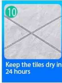
Keep the tiles dry in 24 hours