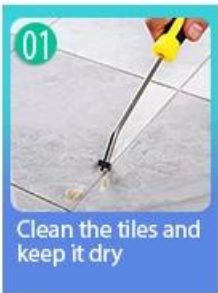
Clean the tiles and keep it dry