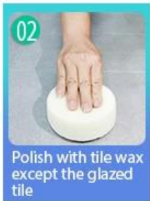
Polish with tile wax except the glazed tile