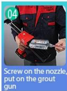
Screw on the nozzle, put on the grout gun