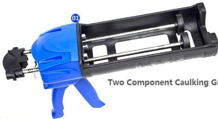
Two Component Caulking Gun